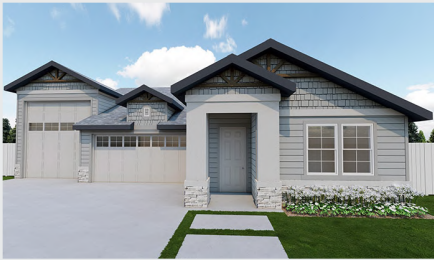
CRAFTSMAN - RV